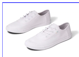
White Canvas Sneakers