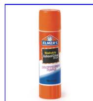
Elmer's Glue Stick