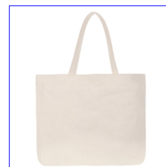
White Canvas Tote Bag

ONLY ONE canvas item per an 8 week session will be requested by the instructor on the first class of the session. Please DO NOT purchase prior to the first class.