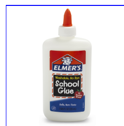
Elmer's Glue Bottle