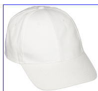
White Canvas Hat