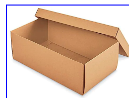
Shoe Box OR Art Box OR Art Bag